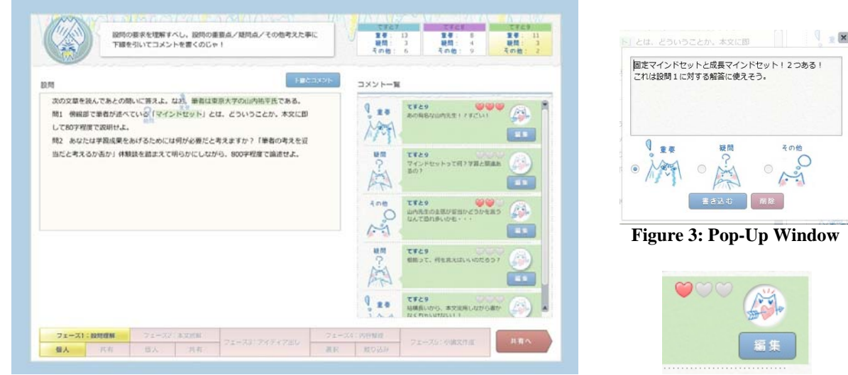
Figure 2: The First Stage (personal mode)

In social mode, students share their thoughts in groups of three. Participating users are shown in the upper right of the screen, and the numbers in each user area show the number of stamps applied by that user. They can see the other student's lines on texts and their comments in right area. From the lines and comments applied by their peers, students can gather ideas that they did not think of themselves or alternative views. Furthermore, students can mark favorite comments or comments that they think important.