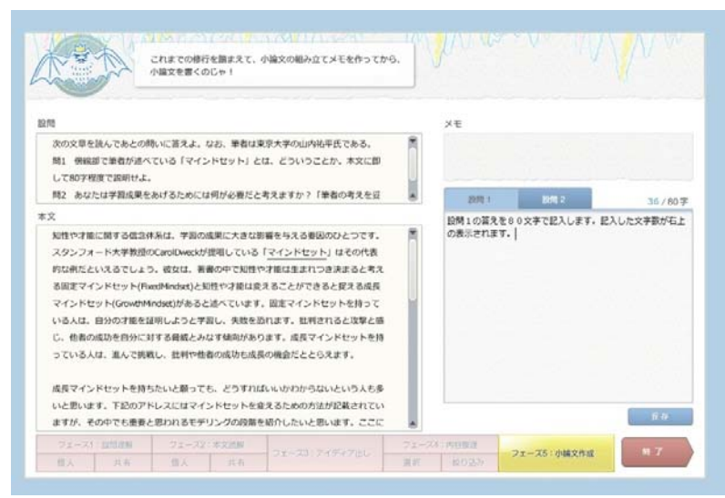
Figure 8: The Fifth Stage

In the fifth stage, students write an essay in the first person. They can take notes in a text area at upper right and sentences in a text box below (Figure 8). The number of Japanese characters used is tracked.