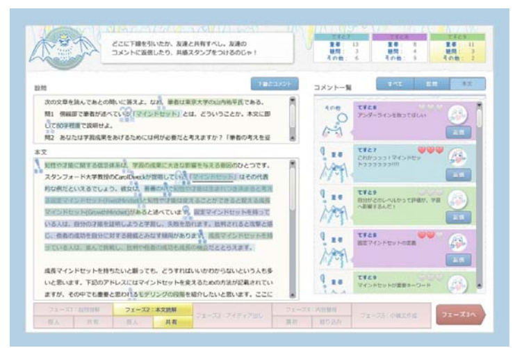
Figure 5: The Second Stage (Social Mode)

The second stage is achieving reading comprehension. In this stage, both personal and social modes are used, with the same functions as in stage 1.