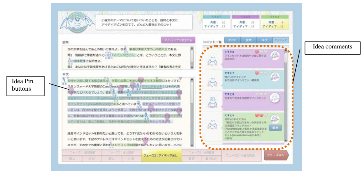
Figure 6: The Third Stage

The third stage is where students express their ideas to answer the question (Figure 6). They can put "Idea Pin" buttons on comprehension, and then they write their thinking to write essay. Though students cannot exchange comments with anyone, they can see other ideas through the system. By extensively expressing their ideas and viewing those of others, they prepare to write the essay. As the student express more ideas, the stamps will change in appearance (Echo will become strong).