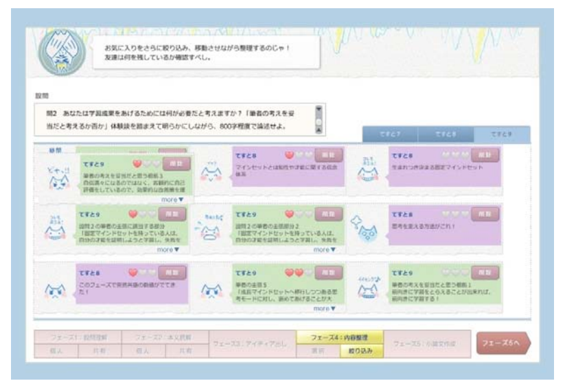
Figure 7: The Fourth Stage

In the fourth stage, students pick their favorite ideas and comments from the previous stages and arrange them in order to produce an essay. All comments that they have selected appear on a separate screen (Figure 7). Then, they arrange them in preparation to write their essays.